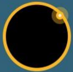
Max View in Pucon